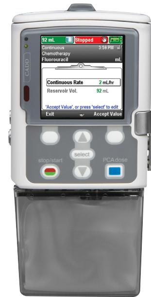
CADD Solis Pump