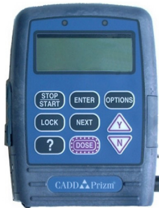
CADD Prizm Pump